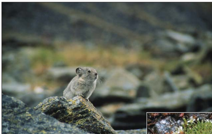
Not at their peak. Warming may threaten alpine creatures such as the pika (above) and plants such as Arenaria tetraquetra (right).

over the next century—moderate as estimates go—will wipe out 80% of alpine islands and extinguish a third to a half of 613 known alpine plants. Co-author Alan Mark, a botanist at the University of Otago in Dunedin, New Zealand, says that even if temperatures stop rising now, 40 to 70 species will be at risk in coming decades, as ecological shifts catch up with already-milder conditions. “There is no question of if—just when,” he says.