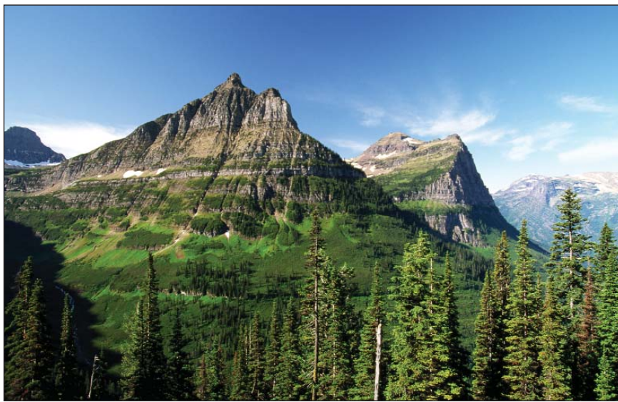
Tundra at the top. Islands of alpine vegetation are sprinkled across high peaks.

The first danger signs have come from plants. About 80 to 100 years ago, European botanists inventoried plants on many summits in the Alps. In 1994, researchers from the University of Vienna showed that on more than two-thirds of the sites resurveyed, grassland species from lower slopes had crept up as much as 4 meters per decade—an apparent response to a 0.7°C regional warming. If the ascent continues, says study leader Georg Grabherr, cold-loving plants at the highest elevations will be pushed upslope and in the