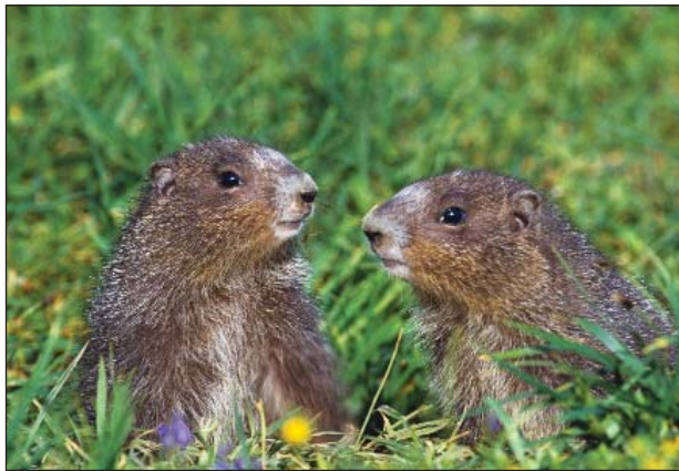
Vulnerable. Marmots, like these from Olympic Peninsula in Washington state, are declining too.